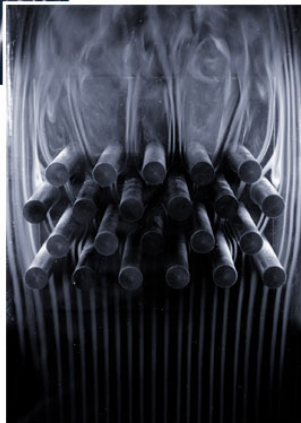
SMOKE TRAILS AROUND THE HEAT EXCHANGER MODEL FROM THE AF80B SET