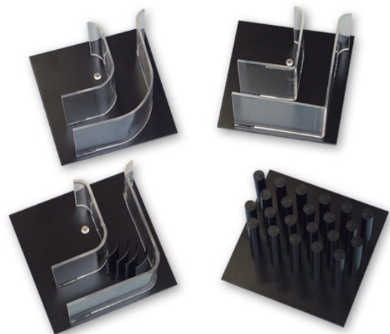
THE OPTIONAL ADDITIONAL MODEL SET AF80B